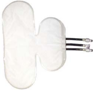
Wrap, Large Butterfly, SPU

0P9BMSWHMR3 – Non-Sterile 0P9BMSWHMR3-S - Sterile