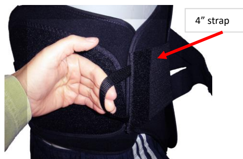
Pull the two 4" straps and attach to the front panel with Velcro.