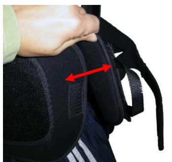
Extend the front panel of the brace around the abdomen.