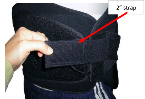
Pull and attach two 2" straps to the front panel to secure.