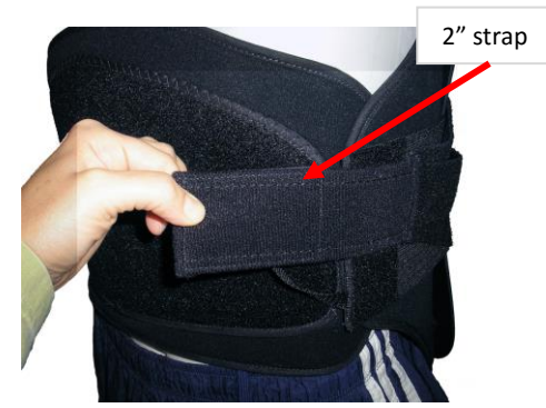
Pull and attach two 2" straps to the front panel to secure.