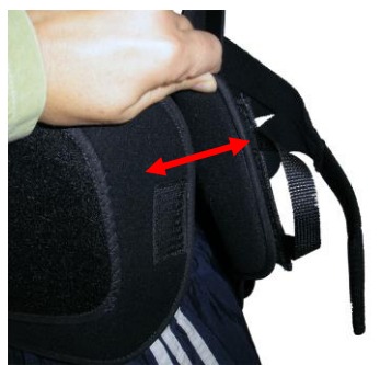
Extend the front panel of the brace around the abdomen.