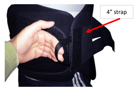
Pull the two 4" straps and attach to the front panel with Velcro.