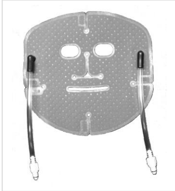
Wrap, Face, SPU