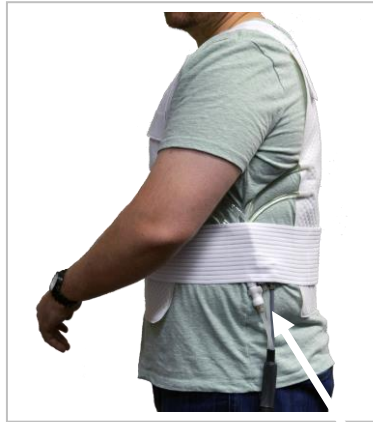
Umbilical hose connection