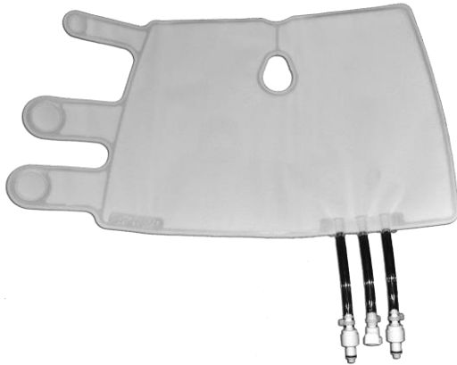
Wrist/Hand Wrap, SPU

Re-Order Part Number: 0P9BWTHDMR3-U (Non-Sterile, Unfilled) 0P9BWTHDMR3-U-CTN (Non-Sterile, Unfilled, Qty: 10) 0P9BWTHDMR3-S (Sterile)