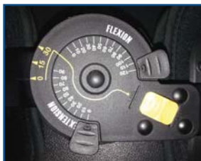
Hinge with quick lock feature