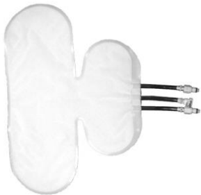
Wrap, Large Butterfly, SPU