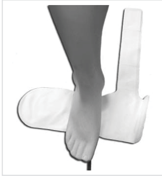
Figure 1 – Wrap, DVT Foot, Push Fitting, SPU

Re-Order Part Number: 0P9BNDVTFT4 (Non-Sterile), 0P9BNDVTFT4-S (Sterile)