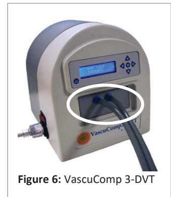
Figure 6: VascuComp 3-DVT