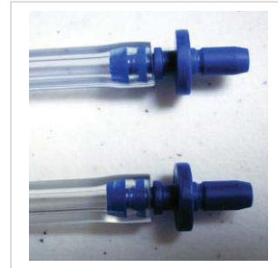
Figure 3: “Push” Fittings