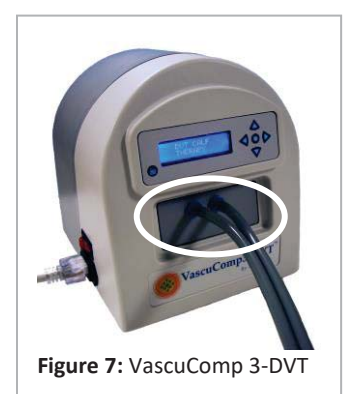
Install fittings to the DVT ports of the unit: