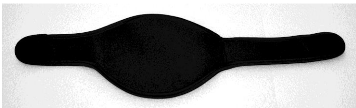
Sling, Shoulder with Harness