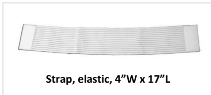
Strap, elastic, 4"W x 17"L