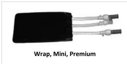
Wrap, Mini, Premium