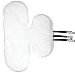
Wrap, Large Butterfly, SPU

Re-Order Part Number: 0P9BSSWHMR3 (Non-Sterile)