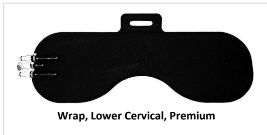
Wrap, Lower Cervical, Premium