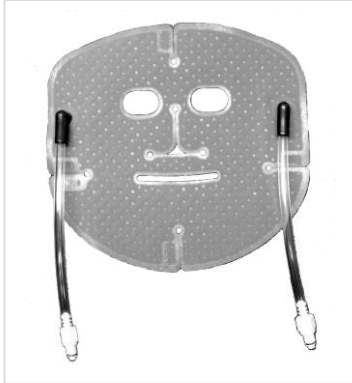
Wrap, Face, SPU