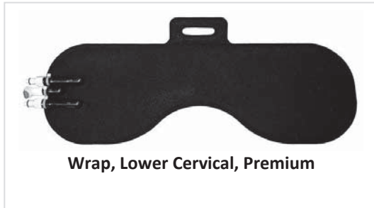
Wrap, Lower Cervical, Premium