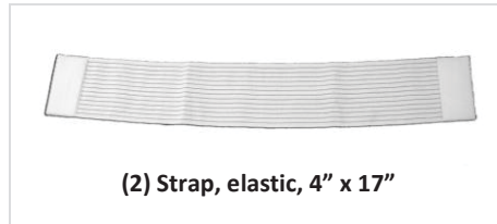
(2) Strap, elastic, 4" x 17"