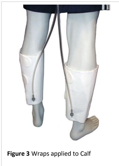
Figure 3 Wraps applied to Calf