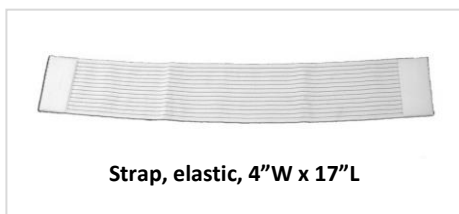
Strap, elastic, 4"W x 17"L