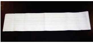
4x17" elastic strap