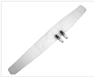
Wrap, Upper Cervical, SPU